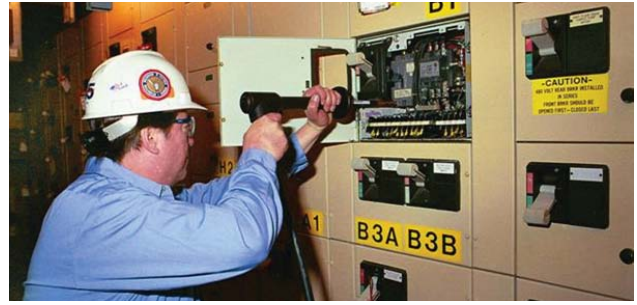
MCCB testing using the HCP2000