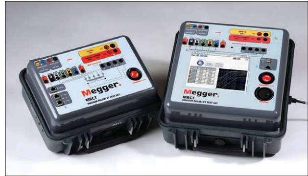
The MRCT is available in 2 onboard display/enclosure options.