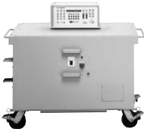
Model PS-9160 Universal Circuit Breaker Test Set