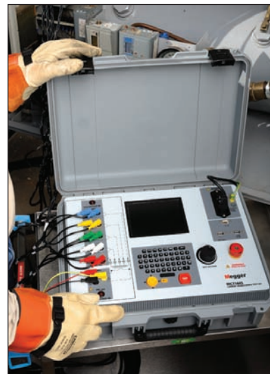
With a manual voltage output control knob, the user is able to perform any test required manually if only a spot check is required.

Onboard memory allows complete test results and data to be stored in one complete file, permitting easy access to quick construction of reports such as saturation curve with knee point. The MCT1605 test file is saved in a Microsoft XML format, thus the data is available to any application that will accept an XML format.