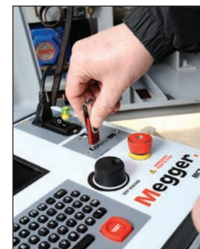
Download test results to a USB device.