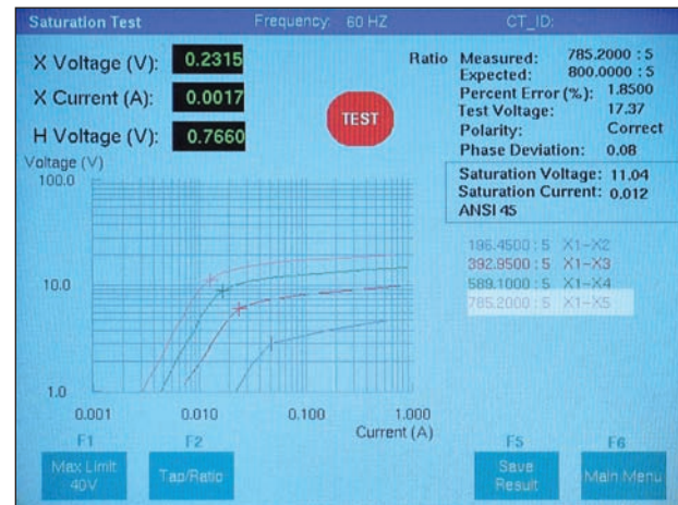
Saturation Curve and all test results displayed at a glance.