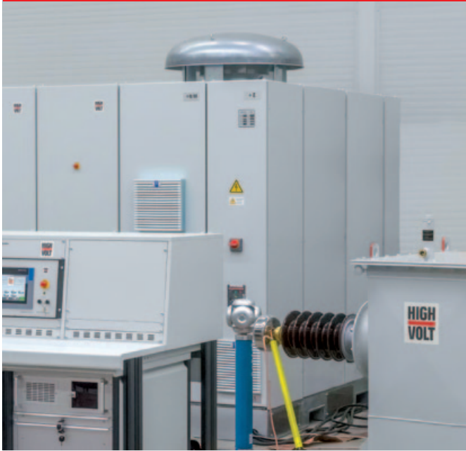
Fig. 1 Fully automated control system and frequency converter