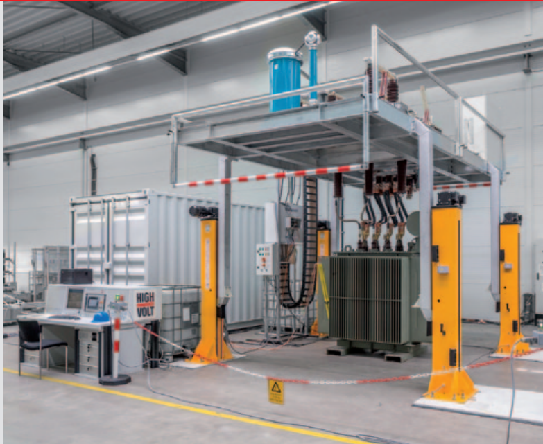
Fig. 2 Example showing the practical implementation of a customer-specific automatic switching system with height adjustment