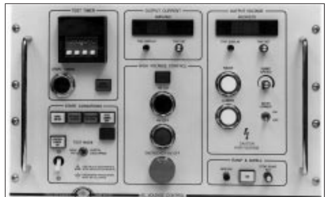
Optional control panel

Special length cable extension assemblies with mating connectors at both ends are available. Specify the cables and lengths needed.