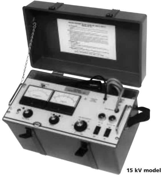
15 kV model