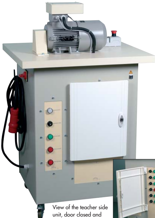
View of the teacher side unit, door closed and open.