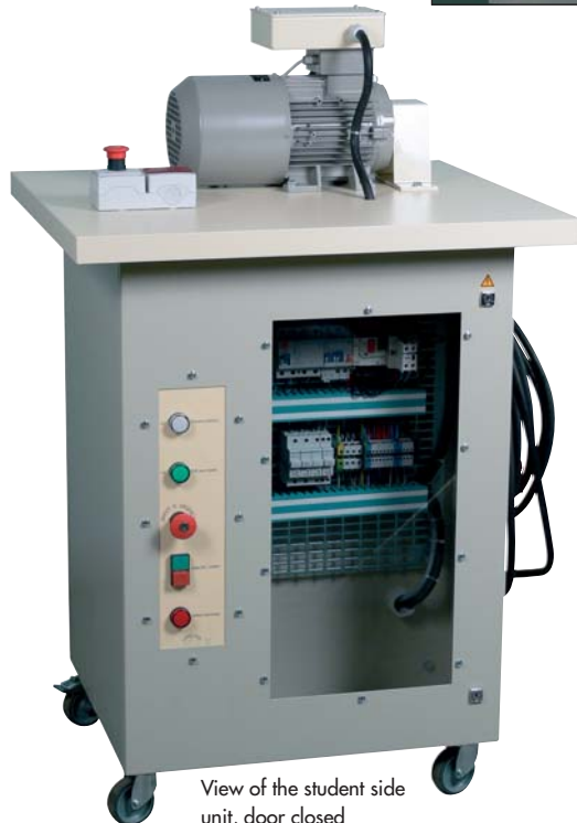
View of the student side unit, door closed