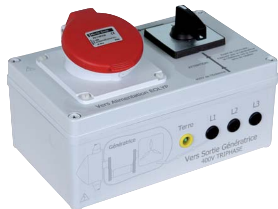
EOLYP is supplied with a network coupling unit. Frame on casters, dim. 1200 x 750mm height: 1820mm